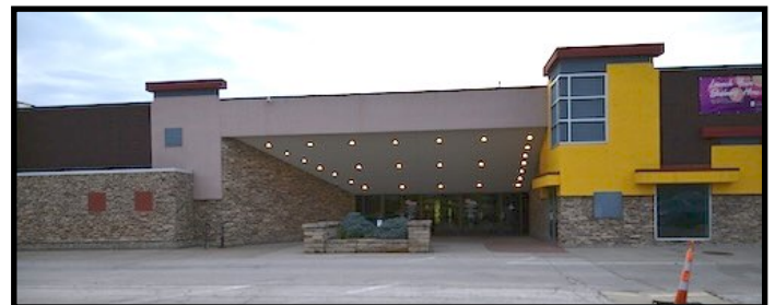
View of Outside Entrance