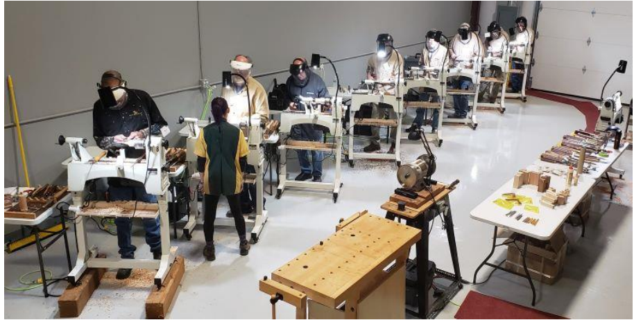
DMWT Training Center

** Must be able to attend all three dates and own required tools, accessories & proper face shield.