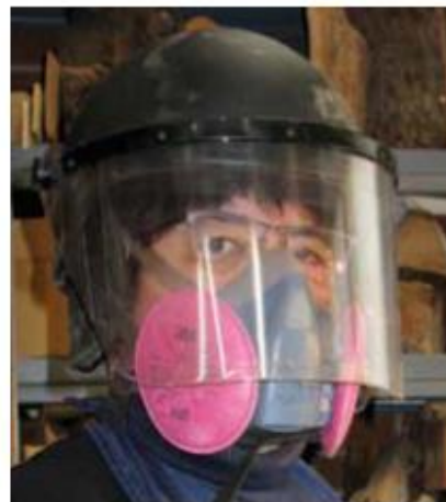
My riot helmet and half-mask respirator