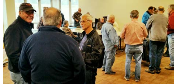
Photos from January 2017 Networking Meeting at the Boy Scout Center – see web site for map

If you've never visited this 4 th Wednesday morning meeting, give it a try. With no program, you're able to meet other woodturners and visit in an informal setting over a cup of coffee. Watch for your e-mail reminder.