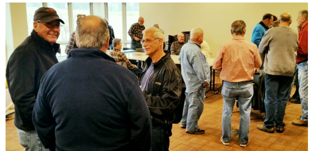
Photos from January 2017 Networking Meeting at the Boy Scout Center - see web site for map

If you've never visited this 4 th Wednesday morning meeting, give it a try. With no program, you're able to meet other woodturners and visit in an informal setting over a cup of coffee. I hope you'll choose to join us as often as possible. Watch for your e-mail reminder.