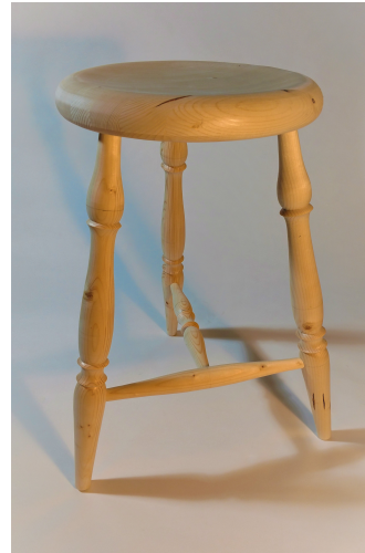
Three Legged Stool Project