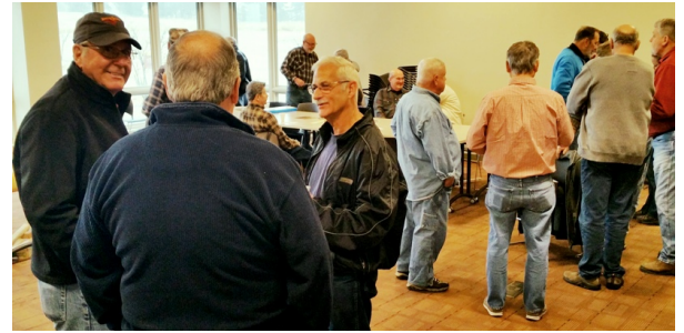
Photos from January 2017 Networking Meeting at the Boy Scout Center – see web site for map

If you've never visited this 4 th Wednesday morning meeting, give it a try. With no program, you're able to meet other woodturners and visit in an informal setting over a cup of coffee. I hope you'll choose to join us as often as possible. Watch for your e-mail reminder.