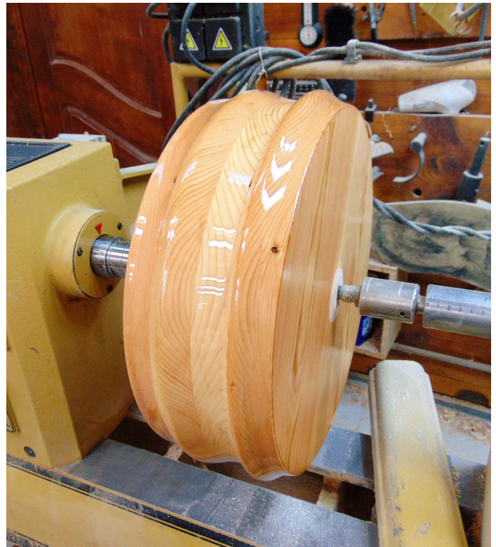
CAB Bowl #37 turned from Douglas Fir

AAW GUEST MEMBERSHIP PROGRAM – AAW continues to offer a Guest membership program for chapter members who are not yet AAW members. By signing up for a complimentary Guest membership, club members can have limited access to AAW member resources for a full 60 days. The Guest membership welcome page can be found at http://www.woodturner.org/page/GuestMemberLanding . All AAW members have access to the materials on this page. Check it out and help them spread the word.