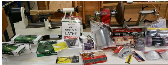
Woodsmith Store display

More than 40 people attended the combined morning and afternoon sessions. Woodsmith kindly provided turning products to display.