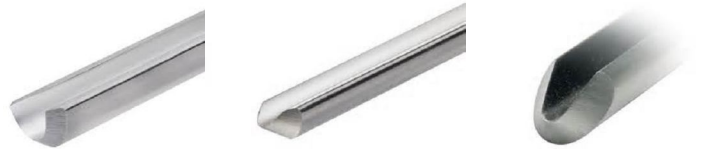
Spindle Roughing Gouge Spindle Gouge Bowl Gouge

Gouge - This is a cutting tool with a 'U' shaped typically used with the bevel rubbing. There are three the roughing gouge, the spindle gouge and the bowl of these tools may have different grinds applied to edges, such as a "standard grind" or a "fingernail" or "side" grind. The different grinds affect the angle in which the cutting edge attacks the wood, and both have advantages and disadvantages.