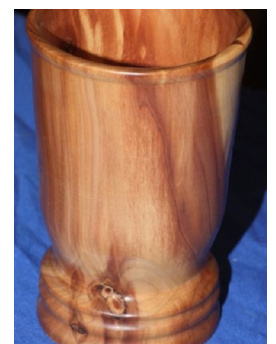
Figure refers to the prominent patterns in the work piece which are either unusual or give the wood its character. Swirls, streaks, geometric patterns, or any other of a number of striking characteristics can make a piece of wood stand out. Figure is highly prized in a piece of wood, but it is only one of many elements which make a piece unique. Design and good execution are at least as important if not more: a beautifully figured piece of wood with tear-out is far less prized than a "simple" but well-executed design.