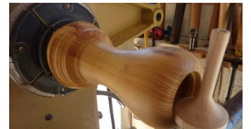
A close up of the Nick Cook funnel used in pear salt shaker.