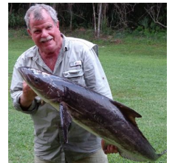
Left - 16 lb Bonita (Both caught on woodturned lure) Right 42 lb Cobia